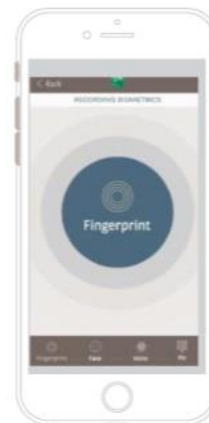
Touch To Approve (Fingerprint ID)