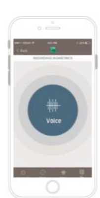
Your Voice Is Your Password (Voice recognition)