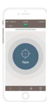
Snap A Selfie (Facial Recognition)